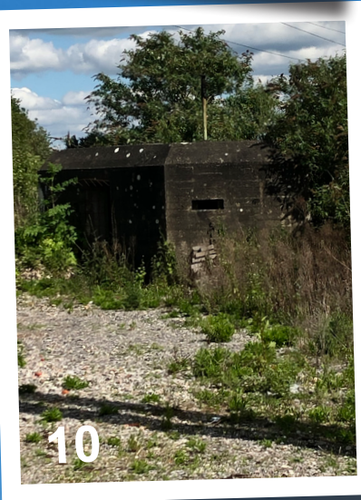
Answers to these questions can be found over the page.